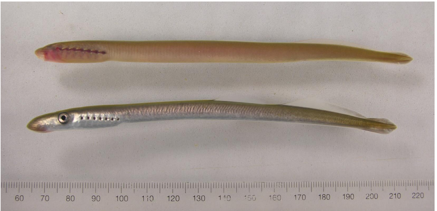
Pacific lamprey ammocoete on top and Pacific lamprey macrophthalmia ( Entosphenus tridentatus ) on bottom, both sampled at the John Day Dam Smolt Facility on 17 May, 2019.