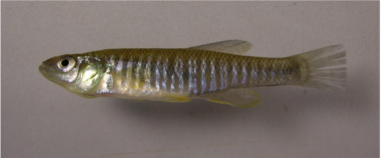
Banded Killifish ( Fundulus diaphanus ), approximately 65 mm total length, similar to a specimen sampled at the John Day Dam Smolt Facility on 2 April, 2024.